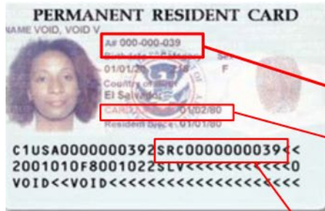
PREVIOUS VERSION PERMANENT RESIDENT CARD (FORM I-551) FRONT AND BACK